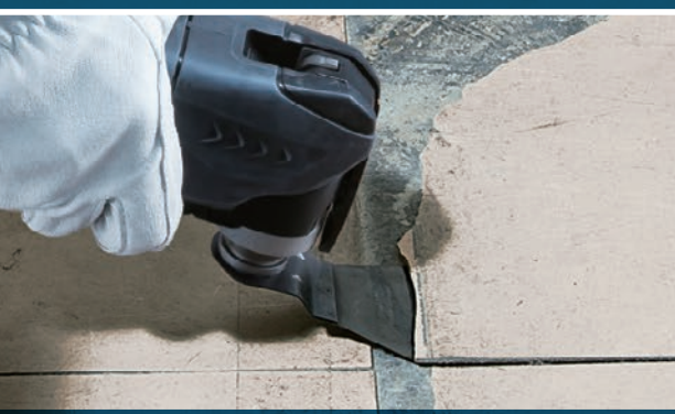
Scraping floor tiles