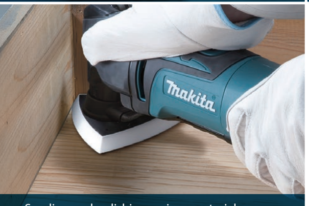
Sanding and polishing various materials