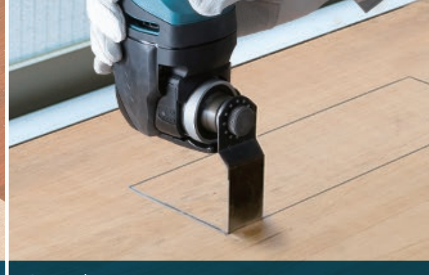
Deep plunge cutting