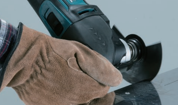
Wood flush cutting