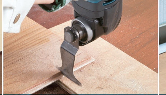
Wood plunge cutting