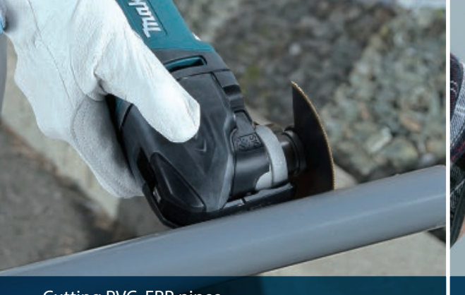
Cutting PVC, FRP pipes