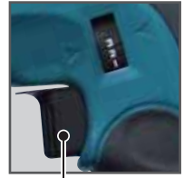
Variable speed control by trigger

Optimum air volume can be selected to suit your application from High/ Medium/ Low by changing the pull length of switch trigger with simple operation of adjusting dial.