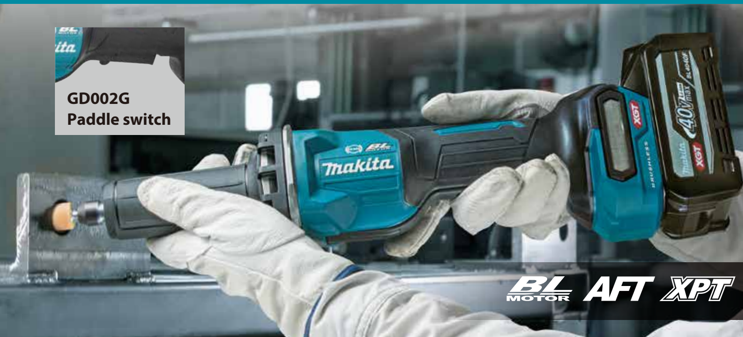
GD002G Paddle switch