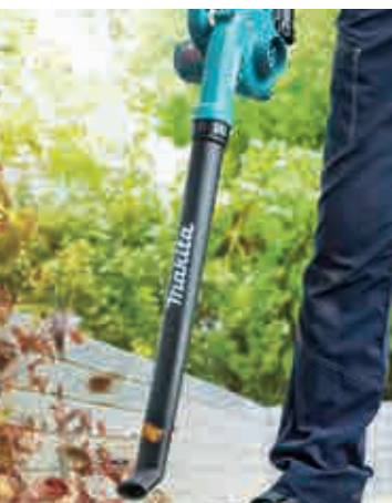
For clearing pathways

With the standard nozzle | Overall length