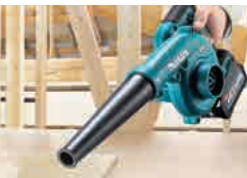
For cleaning around job sites