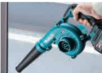
For blowing in grooves