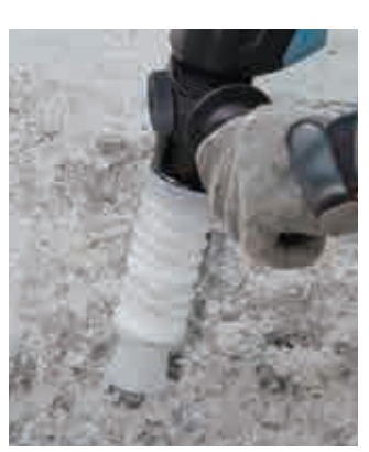
Drill chuck set HR2670FT: Part No. 191F46-4