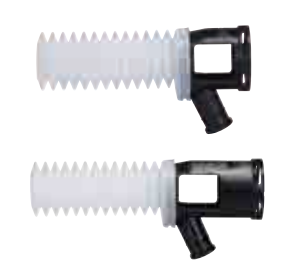
Dust extraction pad set Part No. 1914X3-8

HR2670: Part No. 1914L7-6 HR2670FT: Part No. 1914L8-4