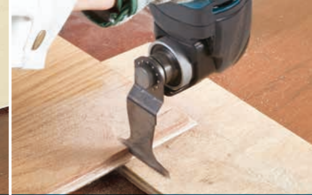
Wood plunge cutting