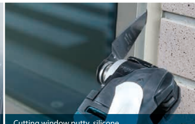
Cutting window putty, silicone