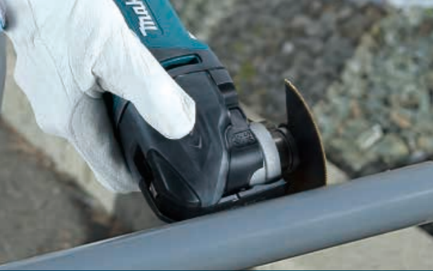
Cutting PVC, FRP pipes