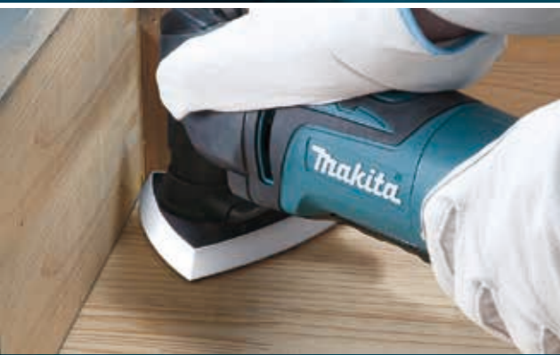
Sanding and polishing various materials