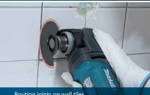
Routing joints on wall tiles