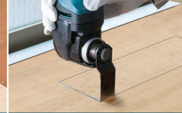
Deep plunge cutting