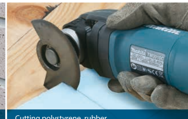
Cutting polystyrene, rubber