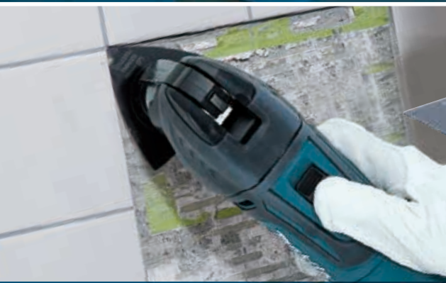
Removing mortar, tile adhesive