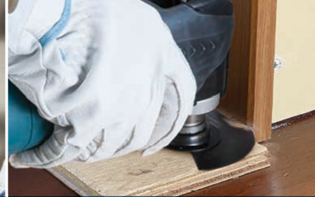
Wood flush cutting