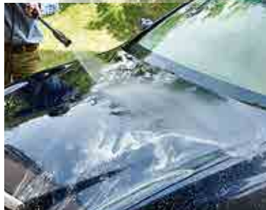
Variable nozzle set