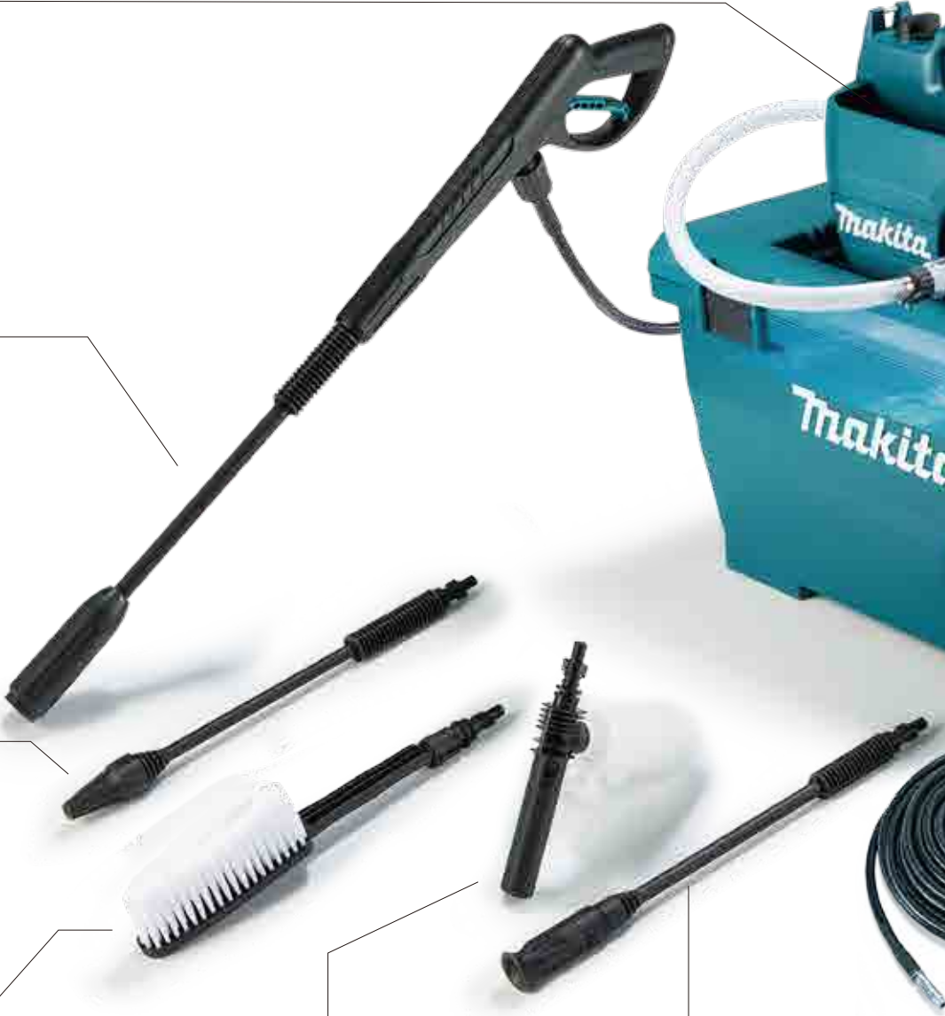
Foam nozzle set