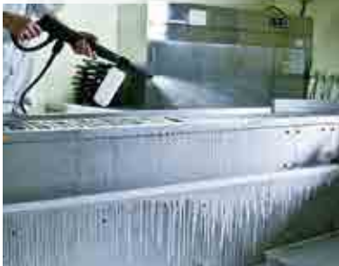
Foam nozzle set